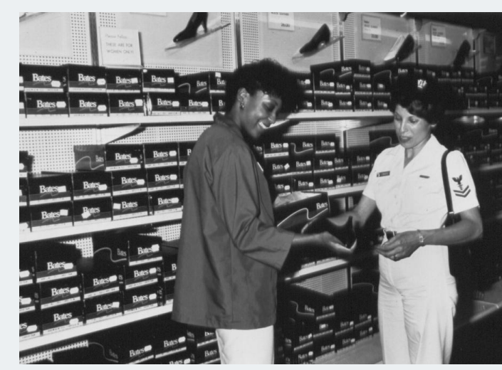
NEX Norfolk Uniform Shop 1980s